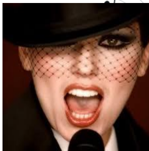
Shania Twain - Man, I Feel Like a Women