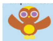
Brown the Owl