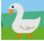
Boo the goose