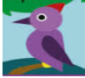
Sherwood the woodpecker