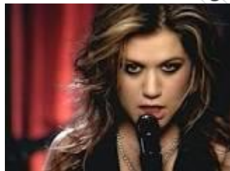
Kelly Clarkson - Since You've Been Gone