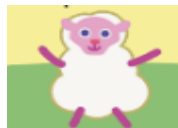
Dee the Sheep

https://www.phonicshed.com/en-gb/resource/phonics-shed-guidance-video-ee-en-gb