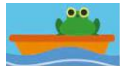
Boaty the Toad