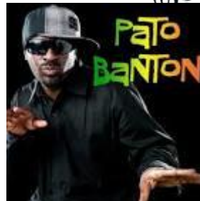
Pato Banton - Baby Come Back