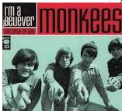
The Monkees - I'm a Believer