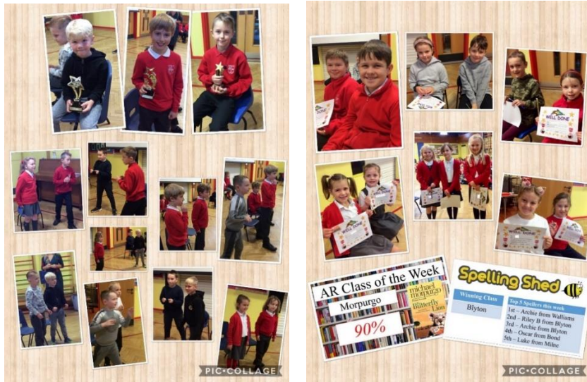
Last week's awards

Every week photos of children who have received a well done are added to our website. Click on News and Events - Well Done Awards to see our latest celebrations